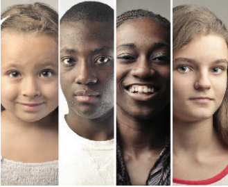
DCCH CENTER FOR CHILDREN & FAMILIES