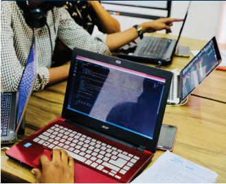
KENTON COUNTY PUBLIC LIBRARY

DCCH Center for Children & Families will use their $10,000 grant award to support their Target Case Management services program, which will increase access to care across the spectrum of providers for Northern Kentucky children on Medicaid. The goal of this program is to provide care coordination and early intervention to avoid admission to, as well as support after discharge from, an out-of-home placement like a group home or foster care.