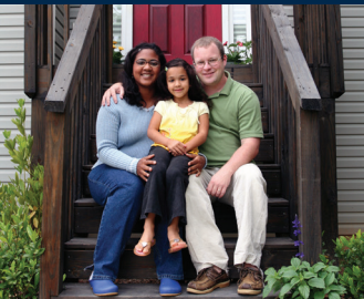
LEGAL AID OF THE BLUEGRASS

Kenton County Public Library will use their $14,700 grant for their Ready to Code program, which engages students who are underrepresented in computing careers including students of color, girls/young women and those economically disadvantaged. Its purpose is to increase the number of students in Kenton County receiving computer science instruction and to increase equity in representation in computing in our region.